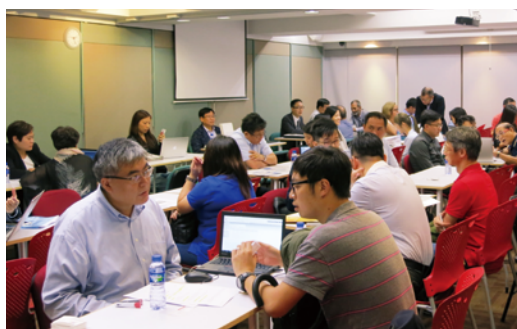
▲ 旅行社與資訊科技公司極速約會。 Speed dating for travel agents and IT companies.