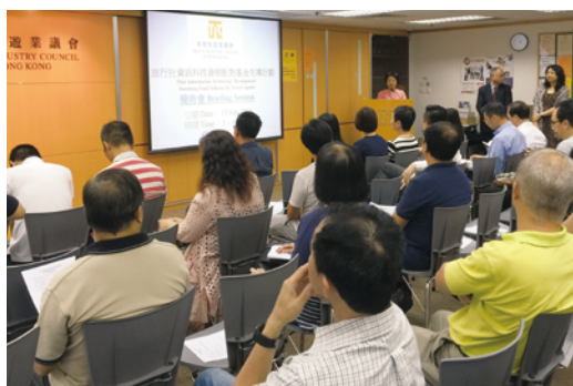
▲ 先導計劃簡佈會。 Briefing on the Pilot Scheme.