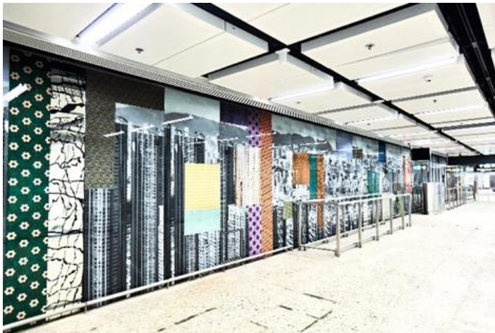
Wallscape Hong Kong